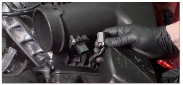
Remove the bolt that secures the airbox to the vehicle. (1x 10mm bolt)